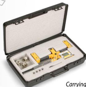
Carrying case available.

Dillon also manufactures highly accurate tensiometers, mechanical dynamometers and crane scales.