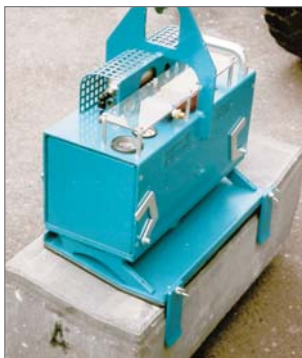
Gamma Levator with specially formed suction pad for TASI-KO plates for petrol stations, carrying capacity 130 kg *.