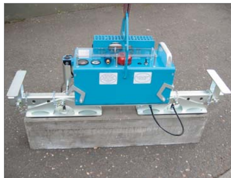
Carrying module G 5 with 2 adjustable suction pads, carrying capacity 150 kg *.