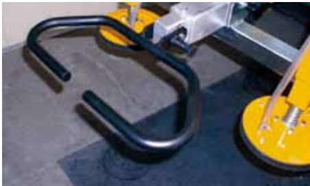
Small resting trestles