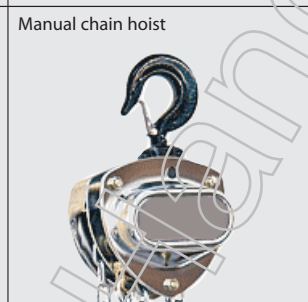
Manual chain hoist