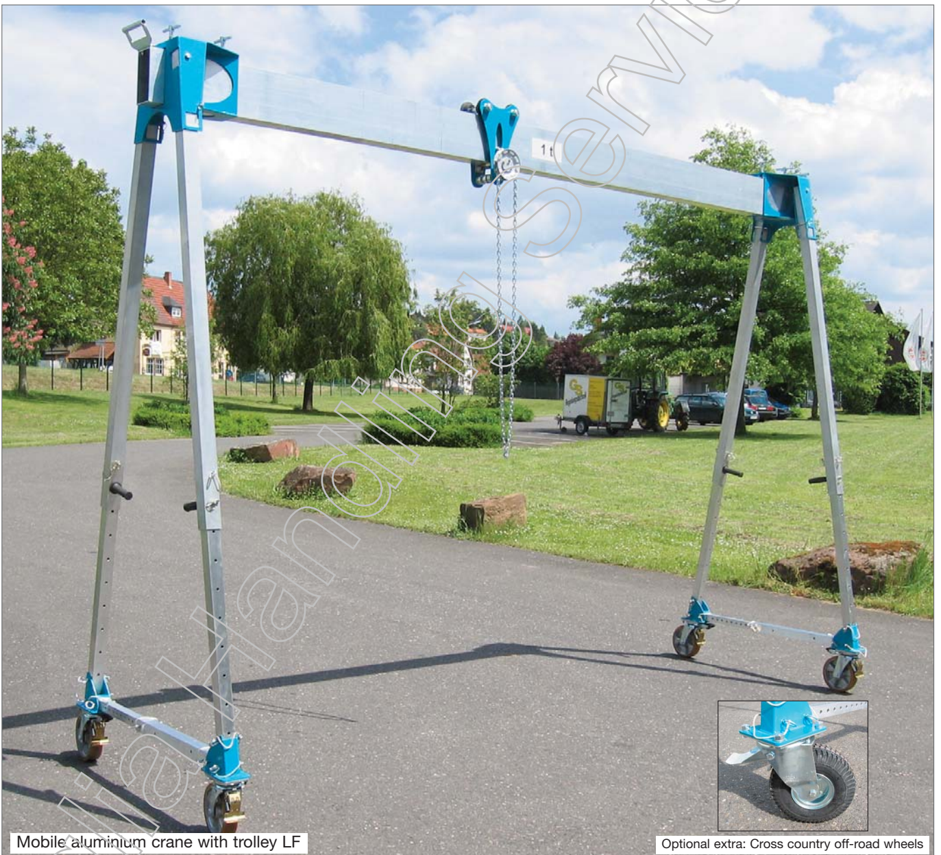
Mobile aluminium crane with trolley LF