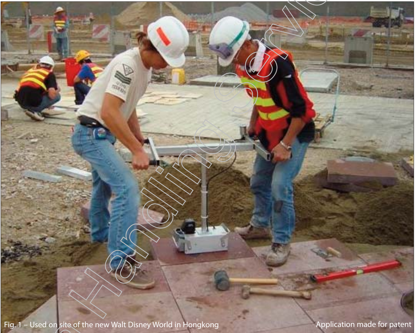
Fig. 1 – Used on site of the new Walt Disney World in Hongkong