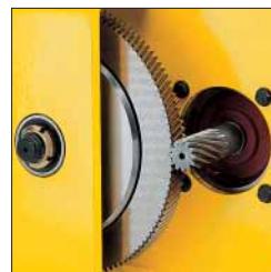
Gearbox with slip clutch (1000 kg capacity)