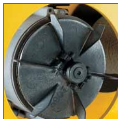
Spring pressure disc brake