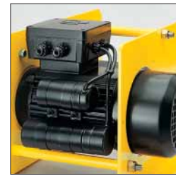
Single-phase A.C. motor