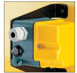
Geared limit switches